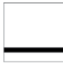
White / Black