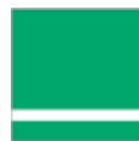
Bright Green / White