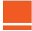
Orange / White