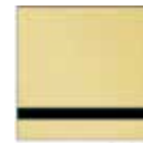
Brushed Gold / Black