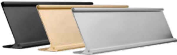
Black Gold Silver