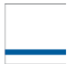
White / Sky Blue