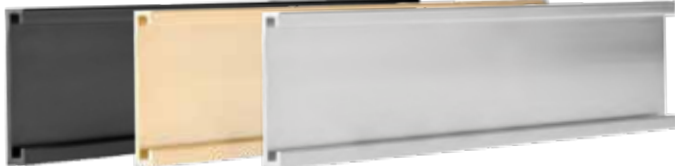
Black Gold Silver