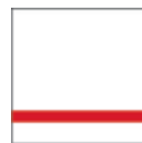
White / Red