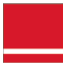
Red / White