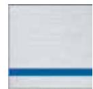
Brushed Silver / Blue