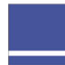
Purple / White