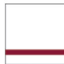
White / Burgundy