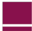
Burgundy / White