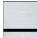
Brushed Silver / Black