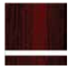
Cherry / White