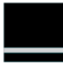
Black / Silver