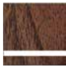
Walnut / White