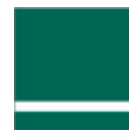
Dark Green / White