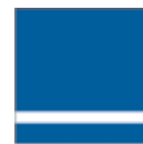
Sky Blue / White